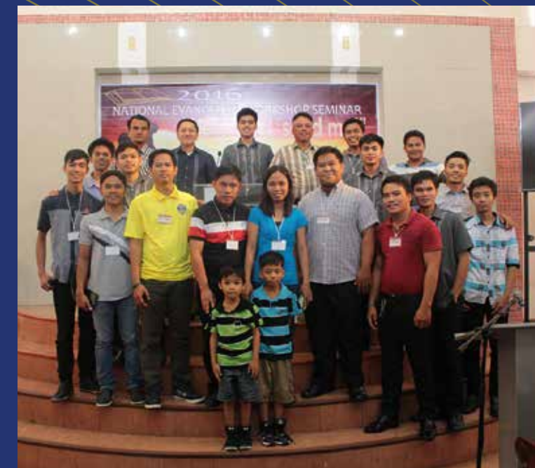
Some of the ACU faculty, staff and students attended a Lectureship program conducted in Manila Philippines