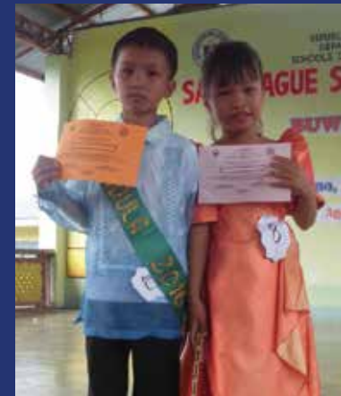
These children also received awards