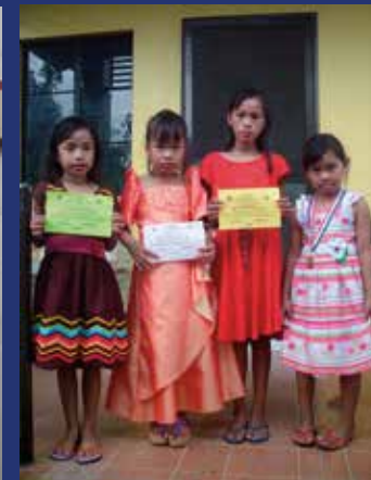
Some of the girls shown with their awards.