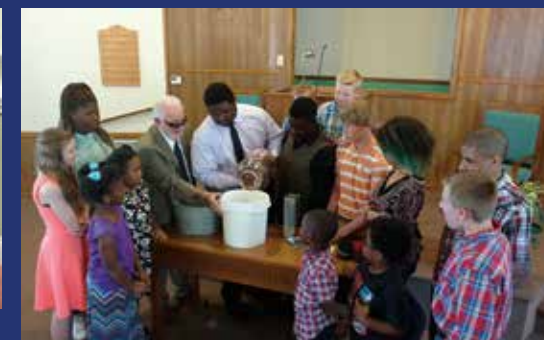
The young people at Winder are pouring coins into the ACU bucket.