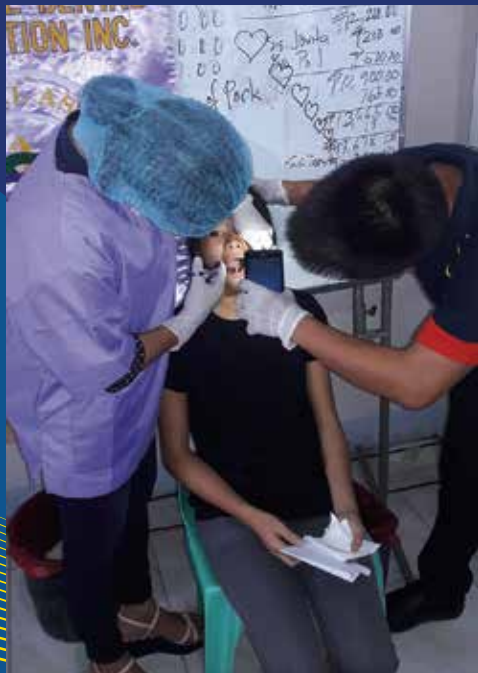
Dentist extracting a tooth. Ouch!