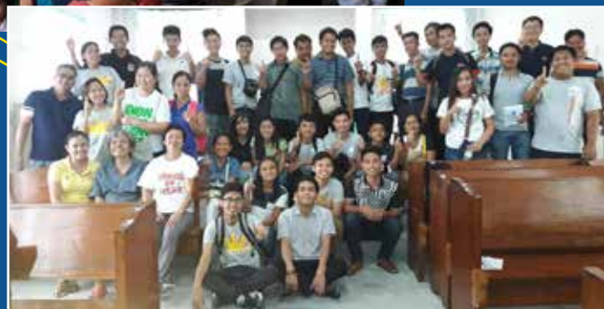
See how happy these Mission volunteers are!