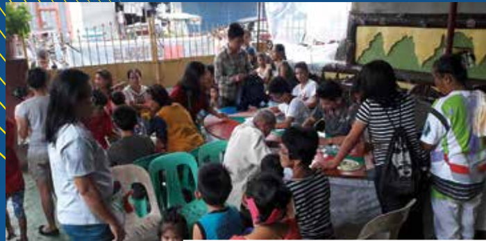
Patients signing in to be treated and waiting for their name to be called