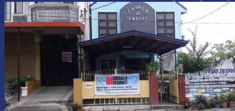
Mangaldan church of Christ venue of medical /Evangelism mission