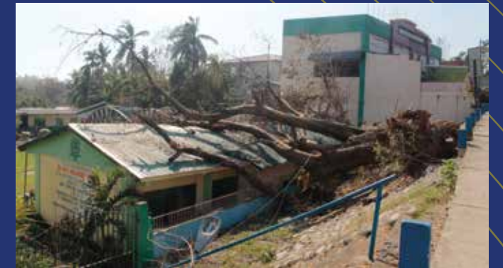
Typhoon Haima damage