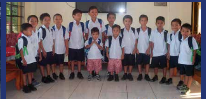
The boys at CHC are ready for their first day of school!