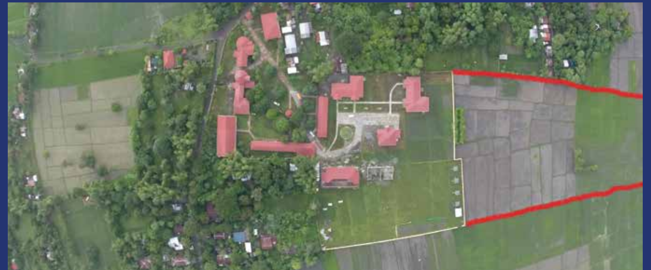
The land shown outlined in red is the land we need to purchase.

We now have the ability to house approximately 50 students at ACU and another men's dormitory would allow us to have lodging for 25 additional students bringing our total to 75 students. Please pray and give to make these dreams and visions become a reality. We need your help. What can you do?