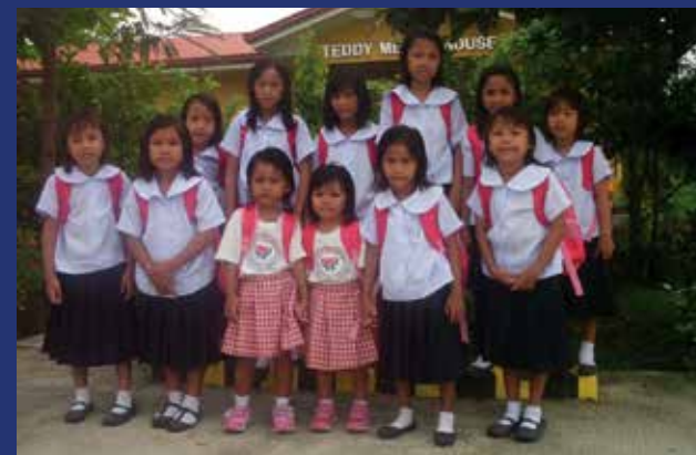
These darling girls are ready for school!