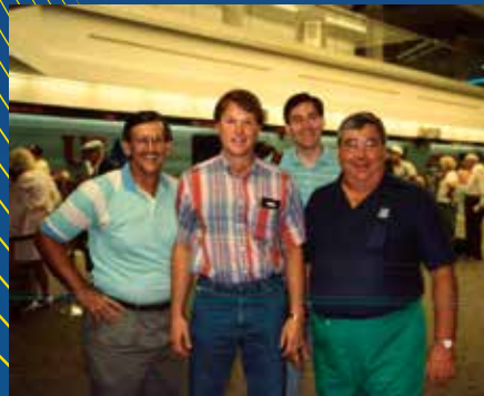
Mission Team in June 1991

In the words of one of our Russian brothers "Thank you for not giving up on Russia"