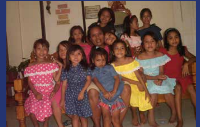
Girls are pleased with the clothes they received for Christmas