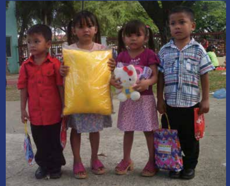
Kids show their Christmas gifts