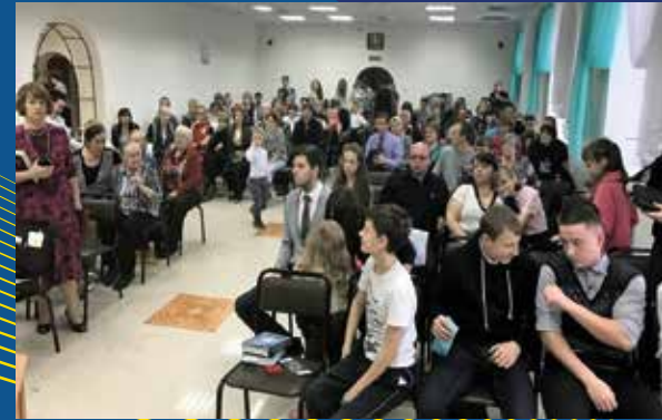
Worship service 25 years later on October 23, 2016