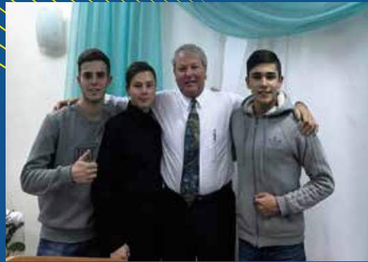
Young Christian Men at Syktyvkar