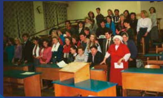
Worship service on October 21, 1991