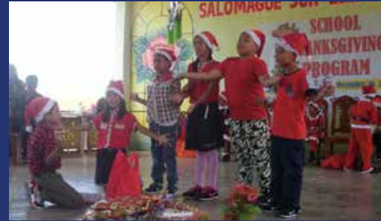
Elementary School Christmas Party

Thanks to those who gave funds for the orphans at CHC so they could have a grand Christmas. They were given a Christmas party and received gifts provided by generous and caring American Christians who gave financially so these wonderful children could enjoy the season. I know God is pleased with His children who give sacrificially to provide proper care for homeless children.