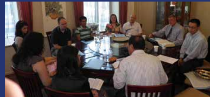
Worship service in Beijing, averaging 10 to 12 participants.