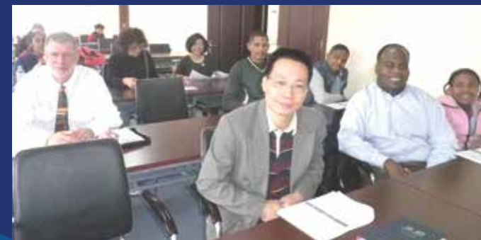
Beijing congregation small but with God's help will grow