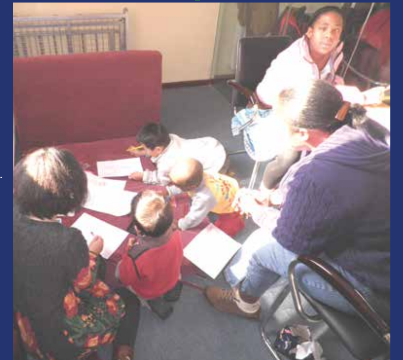
Class for the little ones