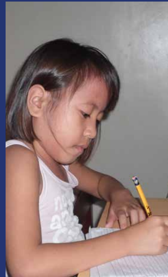
Educating our little ones is a priority at CHC!