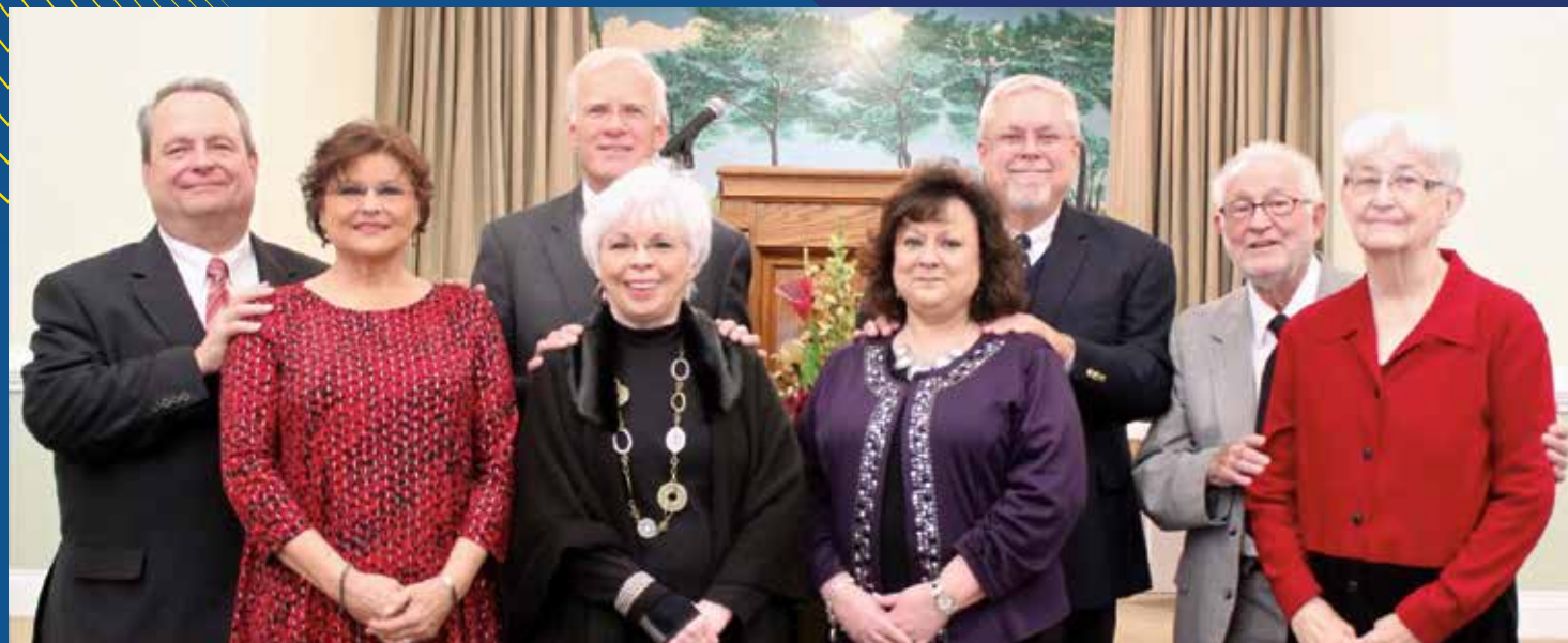
The elders of Adairsville Church of Christ with their wives.

With God’s blessings, we believe 2016 will be a banner year for ACU, our good Filipino brethren, and God’s kingdom throughout the world! Please join with us as we “press toward the goal for the prize of the upward call of God in Christ Jesus,” (Phil. 3:14).